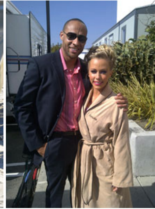
On the set of DWTS. Hmmmm... wonder why I'm smiling?