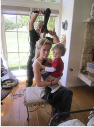
It's all about multitasking.