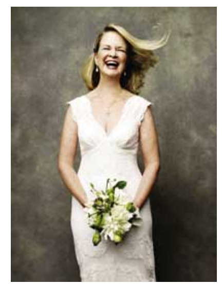
A veil makes you a bride. Without a veil you're just a pretty girl in a white dress!