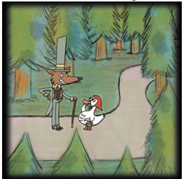
Test Background: Once the characters started to come into focus, it was time to go through the same process with the backgrounds...

Goodwolf Sketch: We use butcher-paper as our tablecloth, so that our family can doodle every night after dinner. (You can see some examples on the Mo Willems Doodles blog.) All of the characters seem to have taken over this night's dinner (I saved the drawing for later reference).