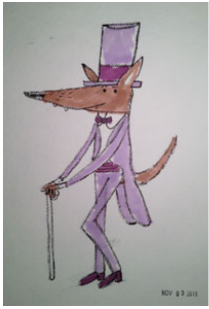
Purple Fox: After I have a sense of a story and their characters, I start to make test sketches. It's my hope that the technique (the brushes, pencils, markers, or crayons) will give me an insight into who the characters really are.

The first step to figuring out a story is your characters. And with each book, I go through hundreds of sketches that aren't used. Here are a few that I did in the early stages of That Is Not a Good Idea! for Hungry Fox, Plump Goose, and the Baby Geese.