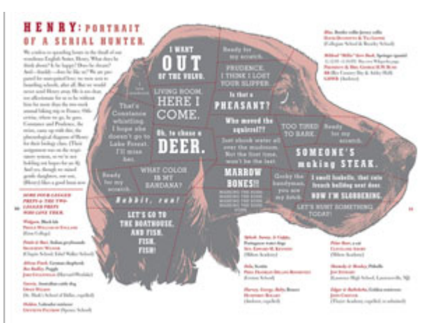
Henry's Head View larger