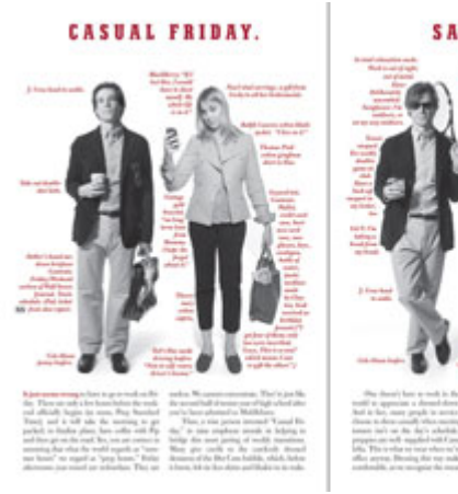
Casual Friday. Saturday. View larger