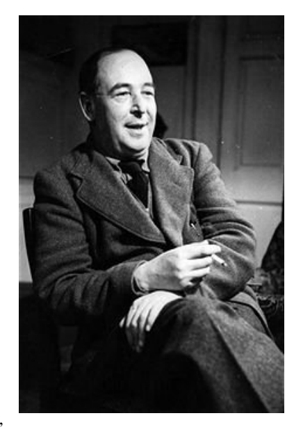
C.S. Lewis.