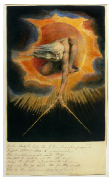
William Blake's Ancient of Days , 1794, relief etching with watercolor, 23.3 x 16.8 cm. British Museum, London.